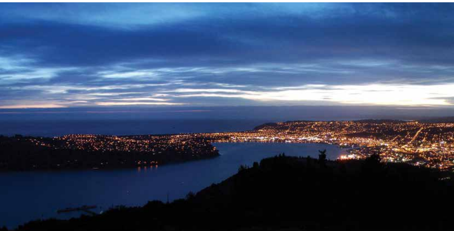
Table 2 xiii provides future workforce projections for New Zealand, which suggest that the proportion of the workforce aged between 15 and 64 years is declining, while the proportion of the labour force that are aged 65+ is expected to grow. For Dunedin, it is projected that those aged 65 and over are expected to be 21-25% of the Dunedin population. This would suggest that Dunedin's aging population will play an increasing role in the Dunedin workforce.

By 2031 Dunedin's population is expected to grow to 129,700 ( Statistics New Zealand, 2014a ).