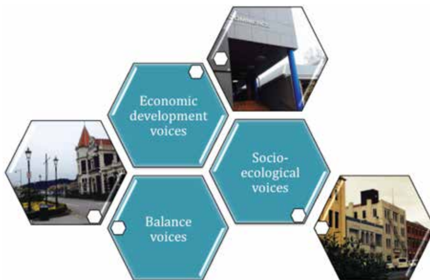
Figure 2: Emerging Participant Voices

The respondents engaged with the scenarios in different ways and broadly speaking, three distinct themes or voices emerged. Throughout the feedback, these three voices intertwined to create a bricolage of conversations that we might imagine occur every day, at every level of society in Dunedin. They are covered, in turn, below.