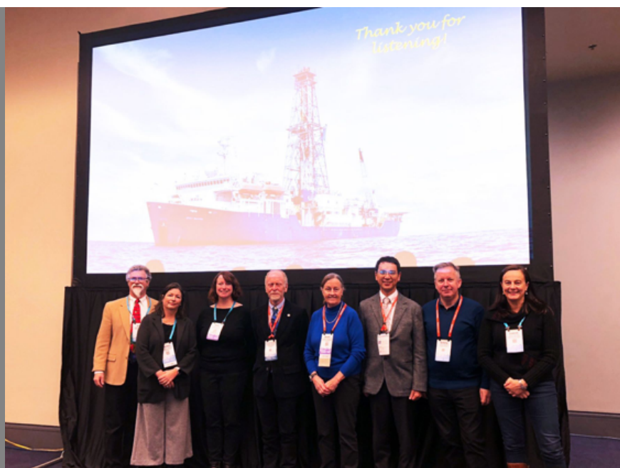
The IODP team at AGU 100 Fall Meeting 2018, held 10-14 Dec in Washington, D.C, with presentations highlighting 50 years of scientific ocean drilling.

For full position details please visit Jobs - ANU . Applications close 15 November 2018.